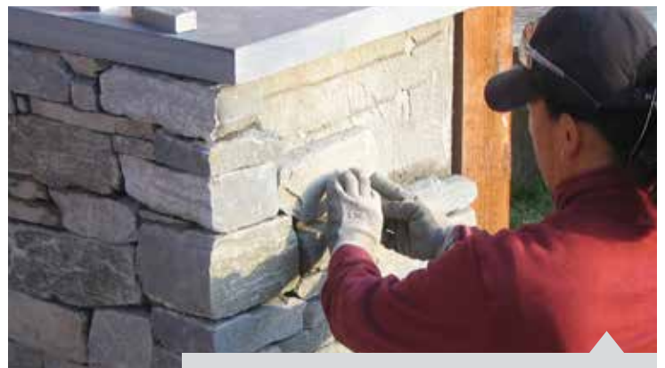
STONE VENEER AS IT IS APPLIED