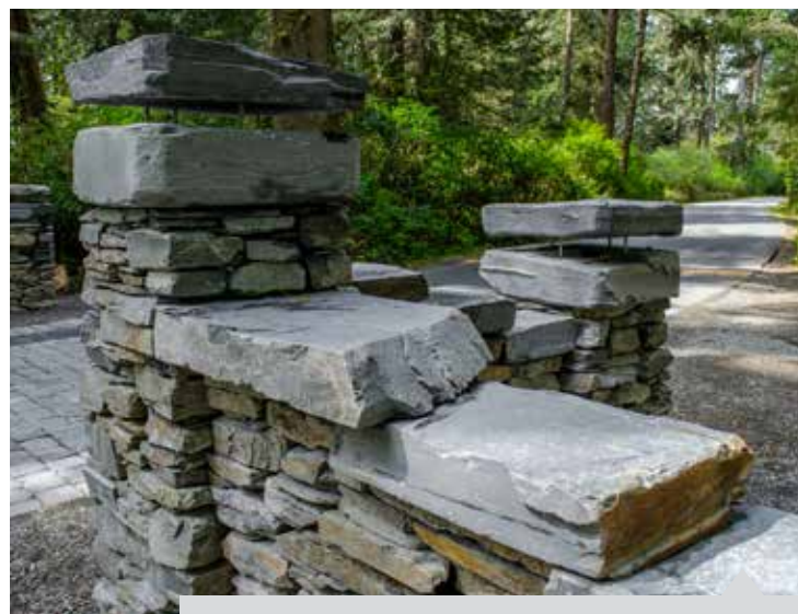
OCEAN PEARL CUSTOM CAPPING