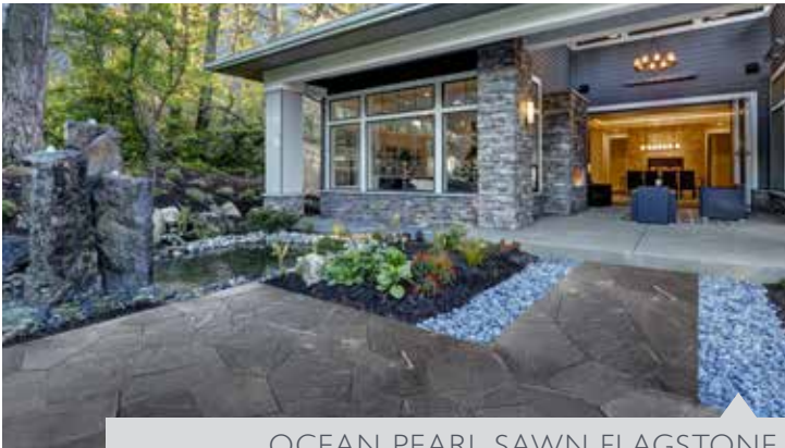
OCEAN PEARL SAWN FLAGSTONE

Ocean Pearl slate flagstone is available in both sawn and split finishes. It can be installed in either a sand or mortar bed, depending on the application and desired appearance. Flagstone makes an excellent ground cover.