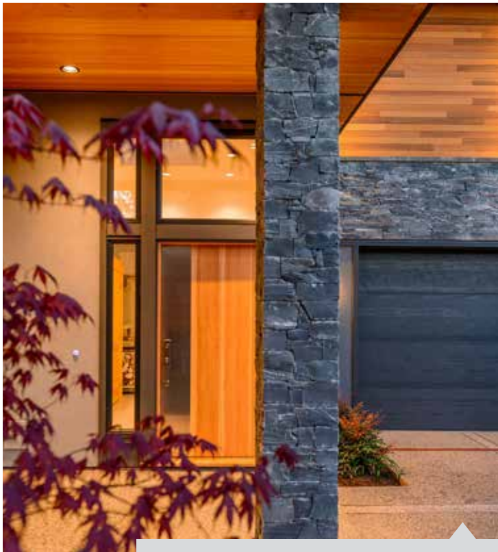
BLACK PEARL LEDGESTONE