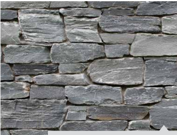
BLACK PEARL LEDGESTONE