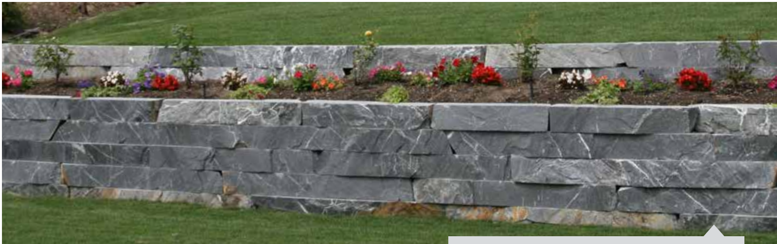
8" CUT WALLSTONE