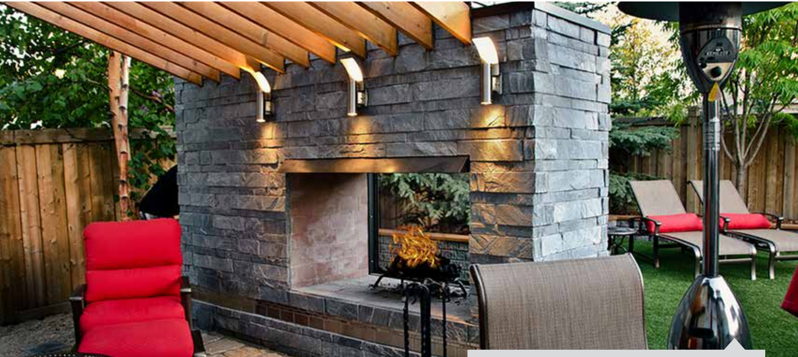
2" AND 4" COURSED PACIFIC ASHLAR