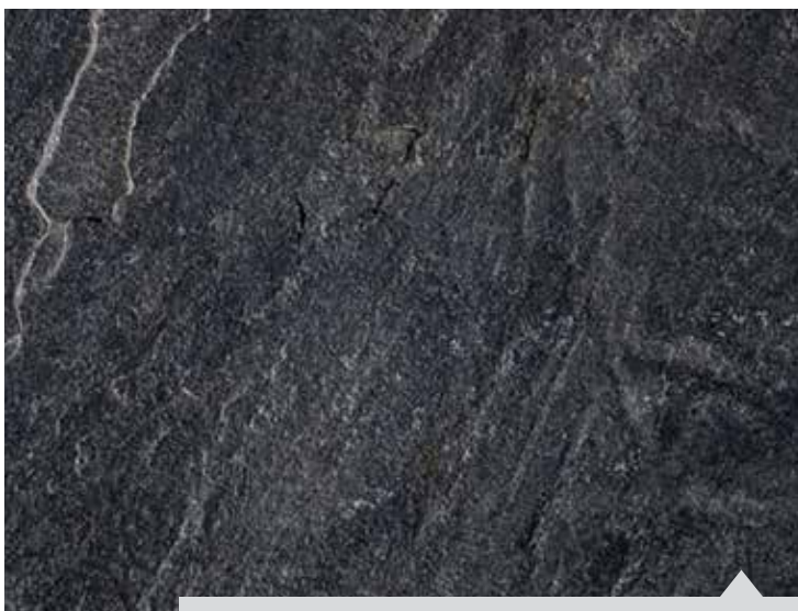
OCEAN PEARL NATURALIZED FINISH