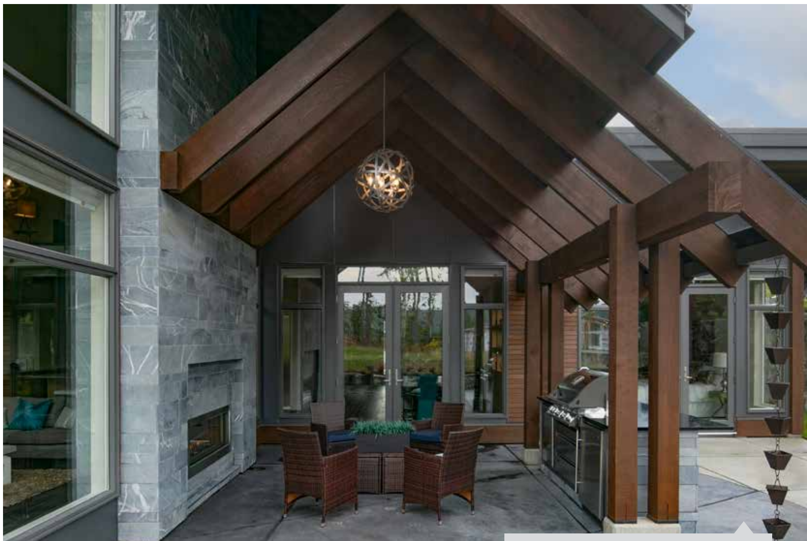
OCEAN PEARL SAWN ASHLAR