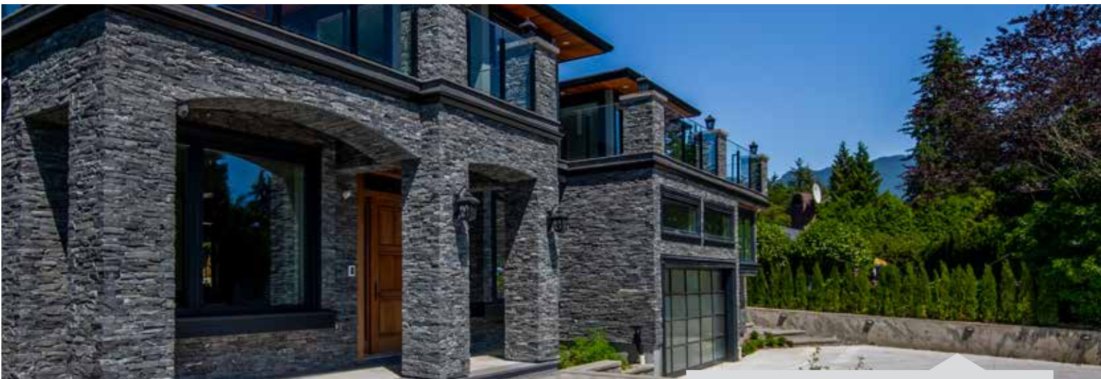
BLACK PEARL MICRO LEDGE