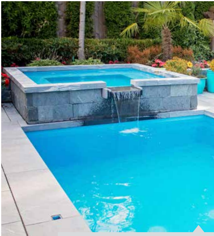
OCEAN PEARL POOL CAPPING