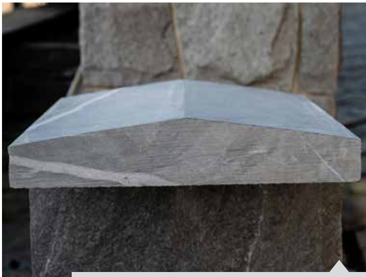
SAWN FRONT EDGE