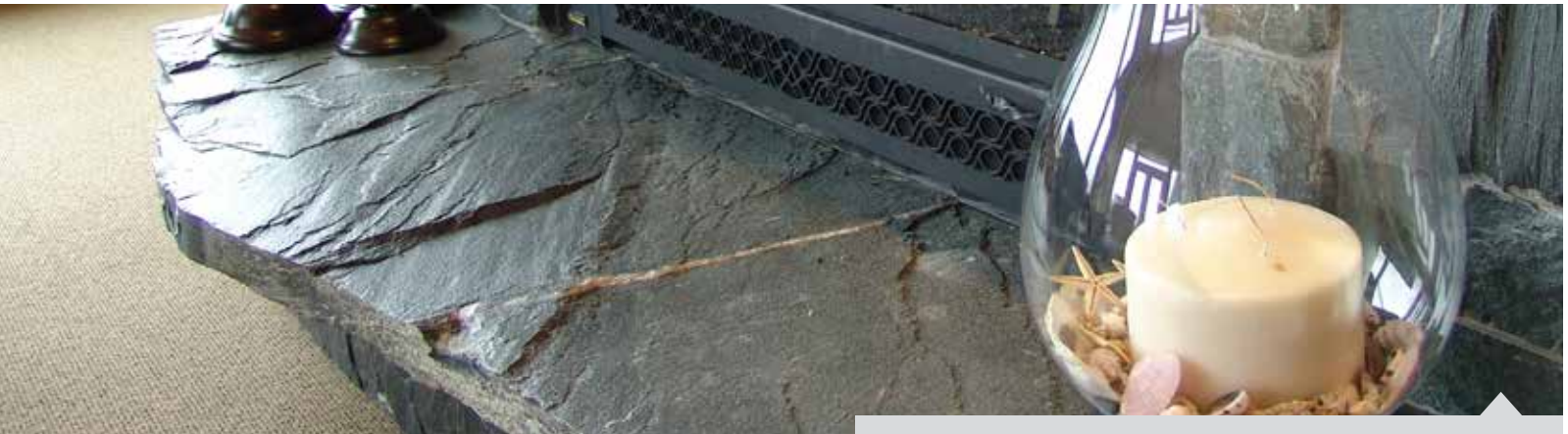
OCEAN PEARL NATURAL TOP & FRONT HEARTH