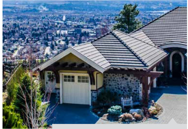
SHADOW RIDGE RANDOM