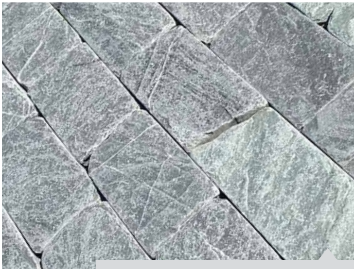
OCEAN PEARL 8" TUMBLED PLANK