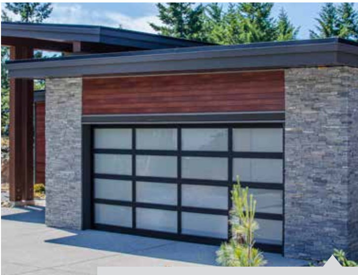
BLACK PEARL MICRO LEDGE