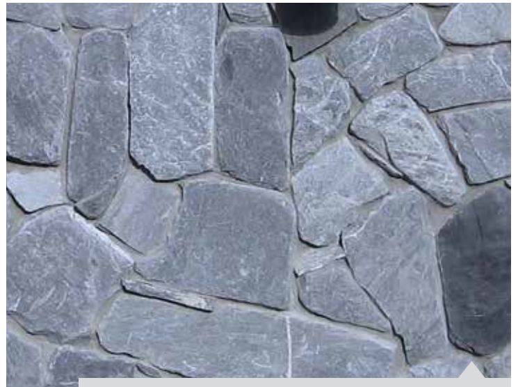
TOFINO SKY FIELDSTONE - MORTAR JOINT