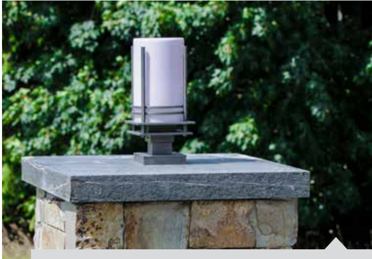
OCEAN PEARL SAWN TOP POST CAP