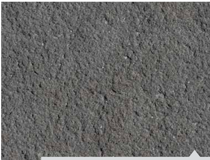
NEWCASTLE NATURALIZED FINISH