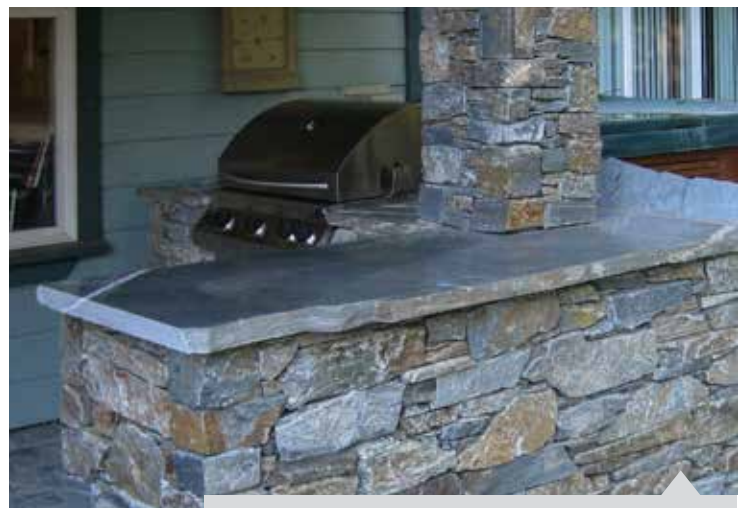
OCEAN PEARL SAWN TOP CAPPING