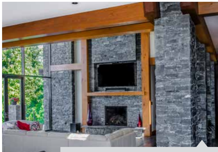
BLACK PEARL LEDGESTONE