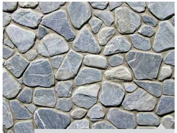
CARMANAH COBBLE - MORTAR JOINT