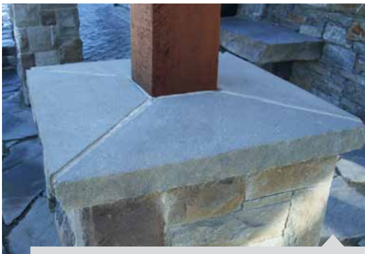
NEWCASTLE MITRED POST CAP