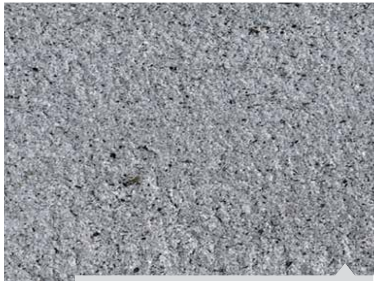
CROWN ISLE NATURALIZED FINISH