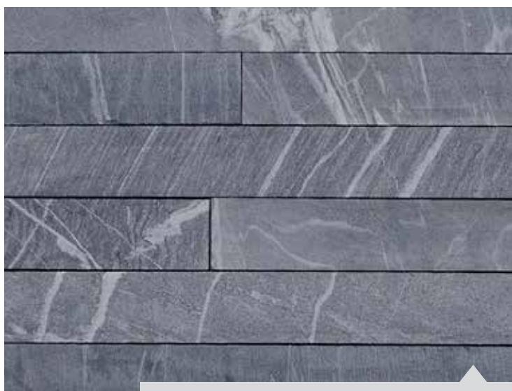
OCEAN PEARL SAWN ASHLAR