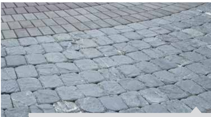
OCEAN PEARL COBBLES