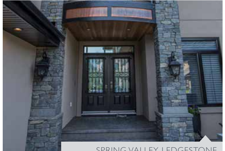
SPRING VALLEY LEDGESTONE