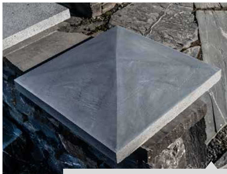
OCEAN PEARL PIER CAP