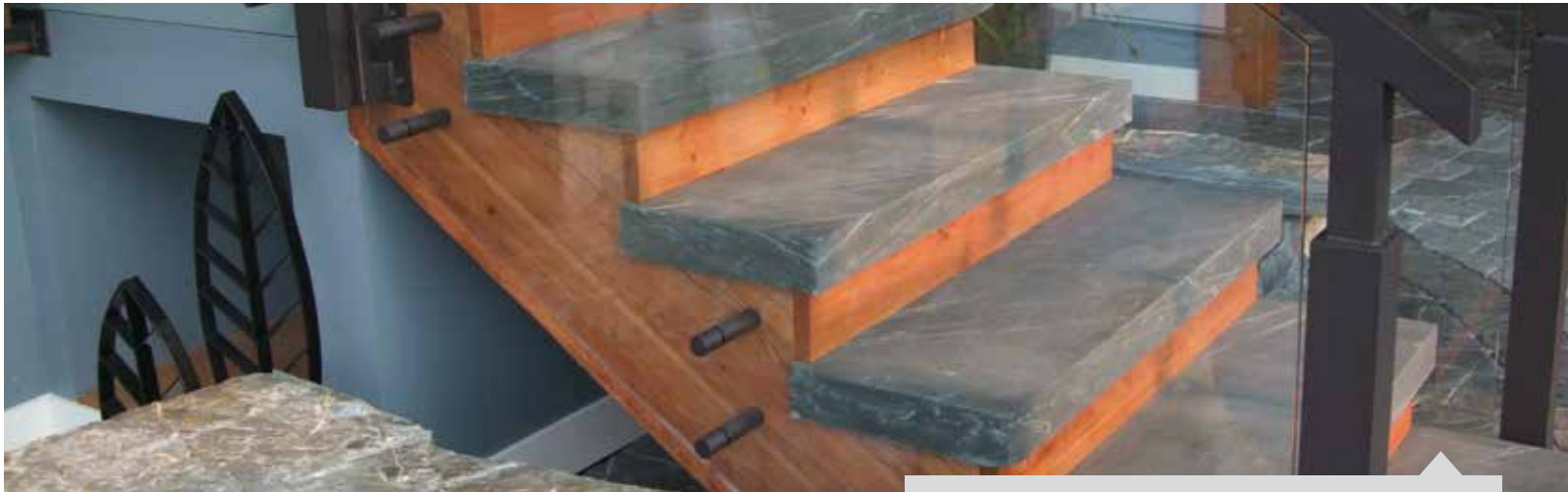
OCEAN PEARL CUT STAIR TREADS