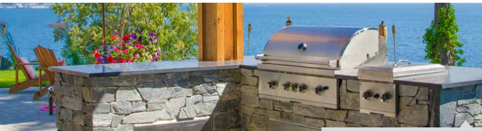
OCEAN MIST LEDGESTONE