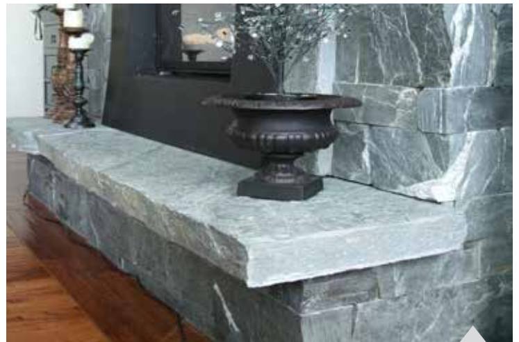
OCEAN PEARL HEARTH AND FIREPLACE TRIM