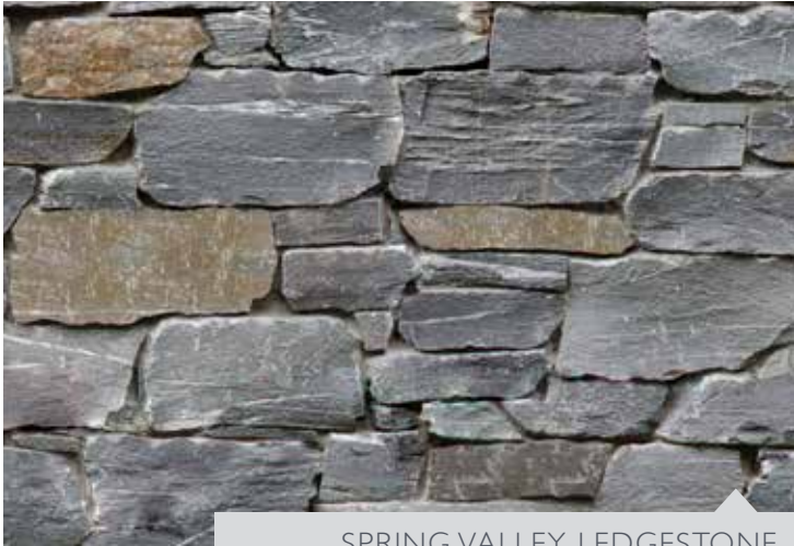
SPRING VALLEY LEDGESTONE