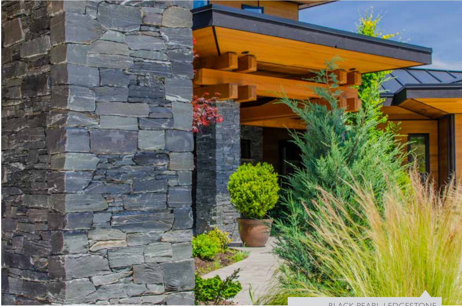
BLACK PEARL LEDGESTONE