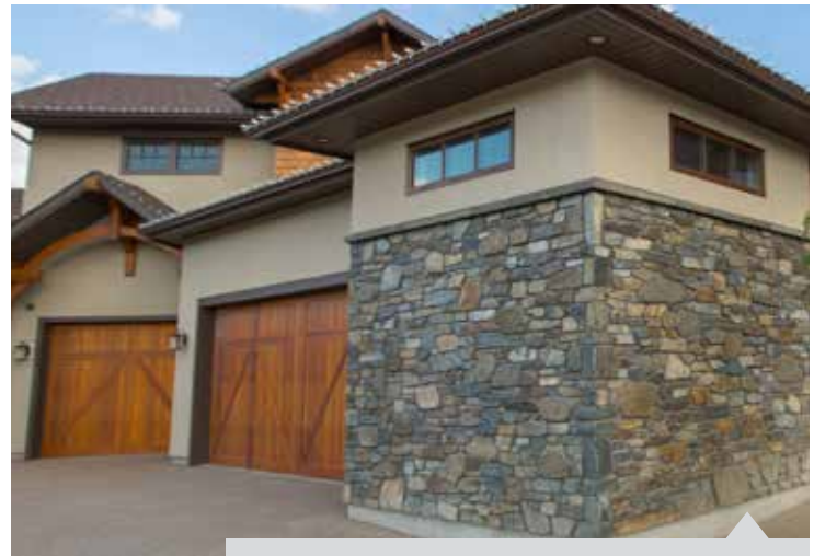
NATURAL / ARBUTUS BLEND