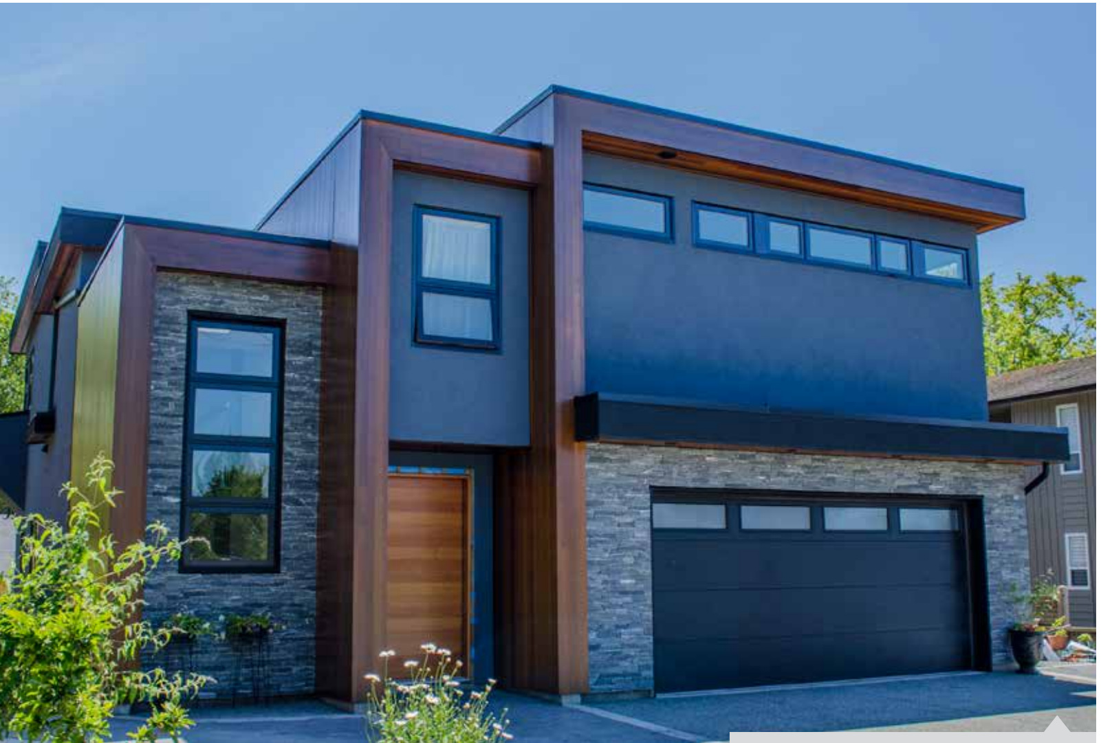
BLACK PEARL MICRO LEDGE