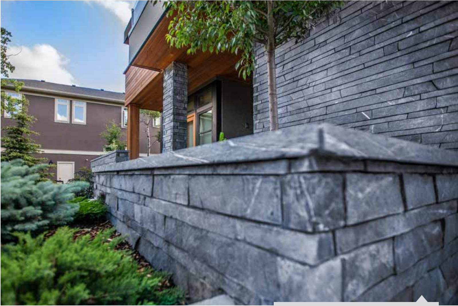
2" AND 4" COURSED PACIFIC ASHLAR