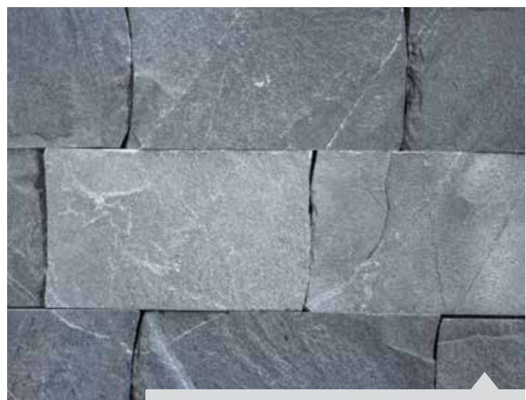
8" PACIFIC ASHLAR