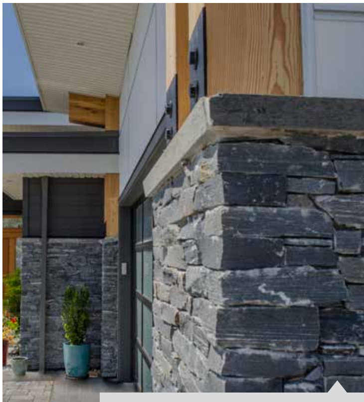
BLACK PEARL MICRO LEDGE