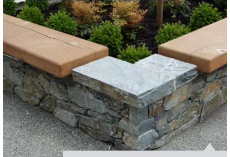
OCEAN PEARL SAWN TOP CAPPING