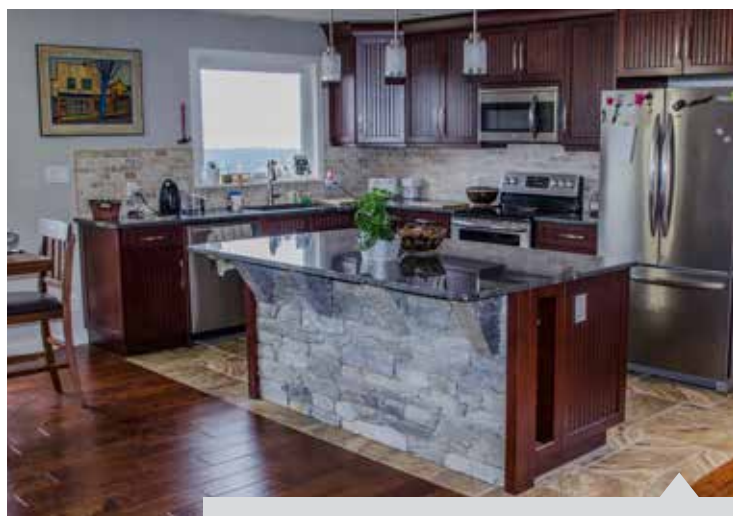
OCEAN MIST LEDGESTONE