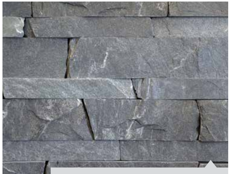
2" AND 4" COURSED PACIFIC ASHLAR