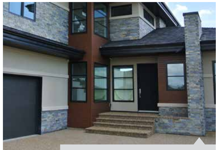
COURSED FULL RANGE ASHLAR