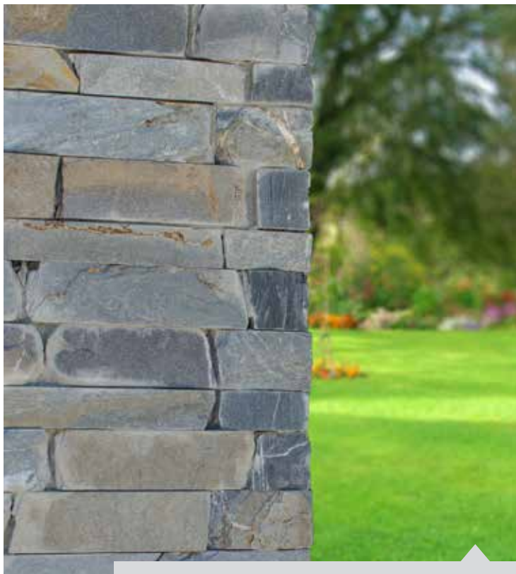
FULL RANGE ASHLAR