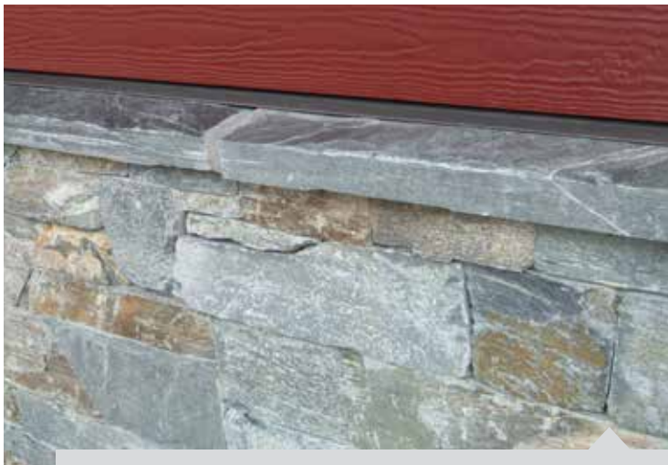
OCEAN PEARL SPLIT TOP WAINSCOT SILL