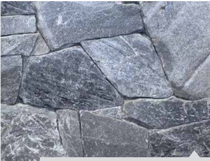
TOFINO SKY FIELDSTONE - TIGHT FIT