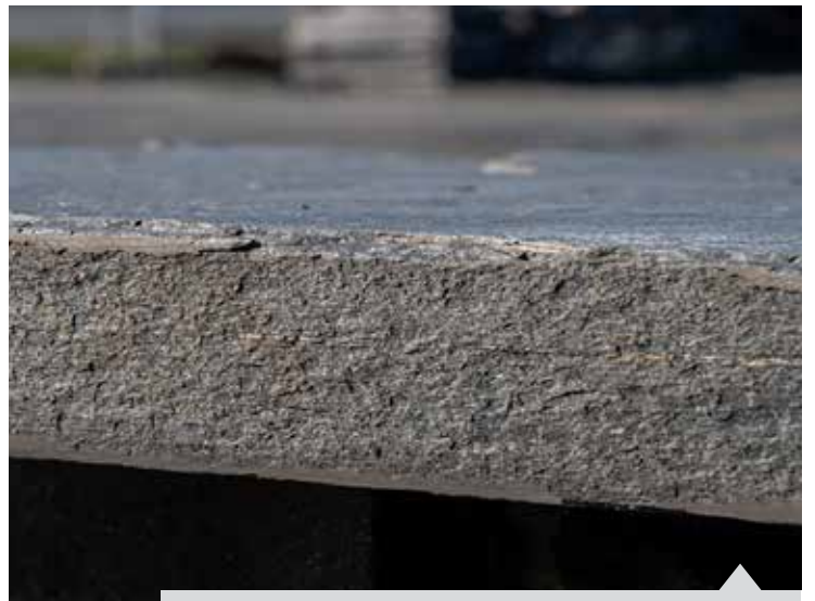
FLAMED FRONT EDGE