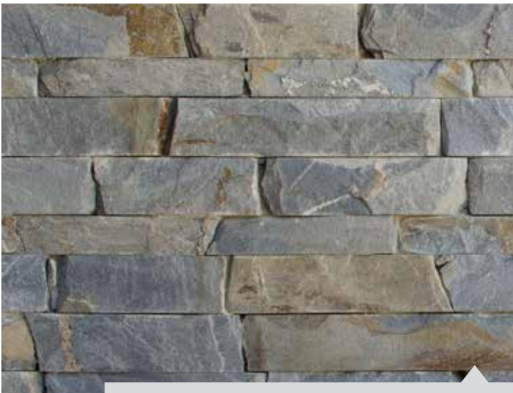
OCEAN PEARL FULL RANGE ASHLAR