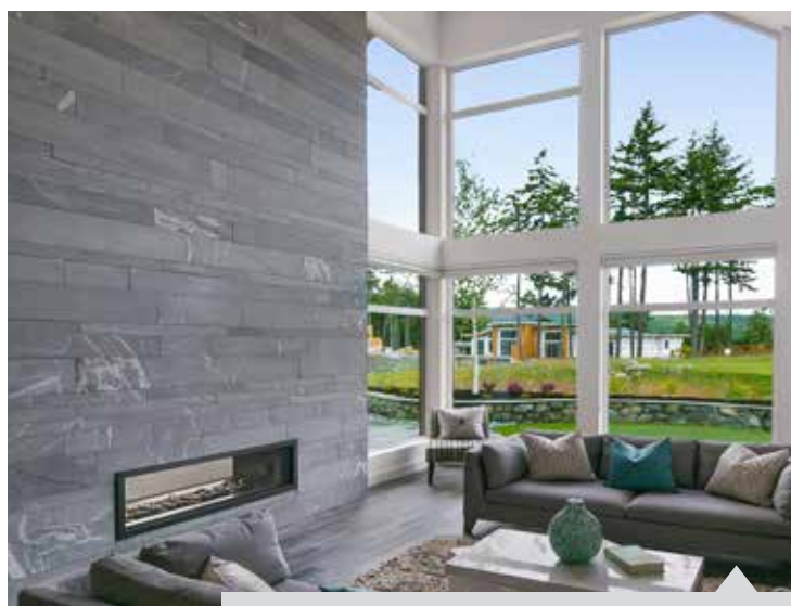
OCEAN PEARL SAWN ASHLAR