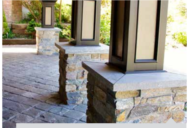
OCEAN PEARL SAWN TOP MITRED POST CAP