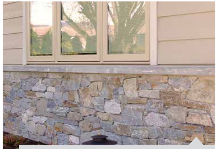
OCEAN PEARL SAWN TOP WAINSCOT SILL