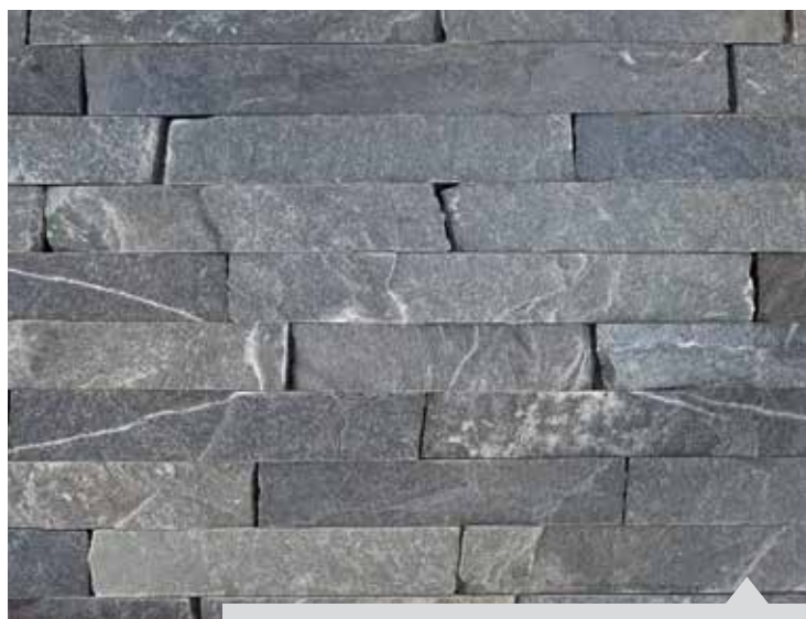
2" PACIFIC ASHLAR