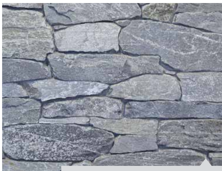
OCEAN MIST LEDGESTONE