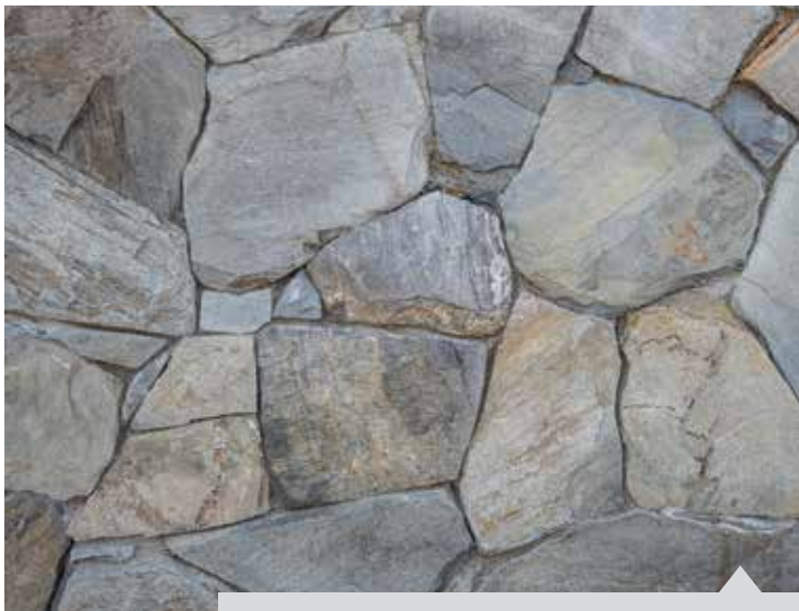
ARBUTUS FIELDSTONE - TIGHT FIT