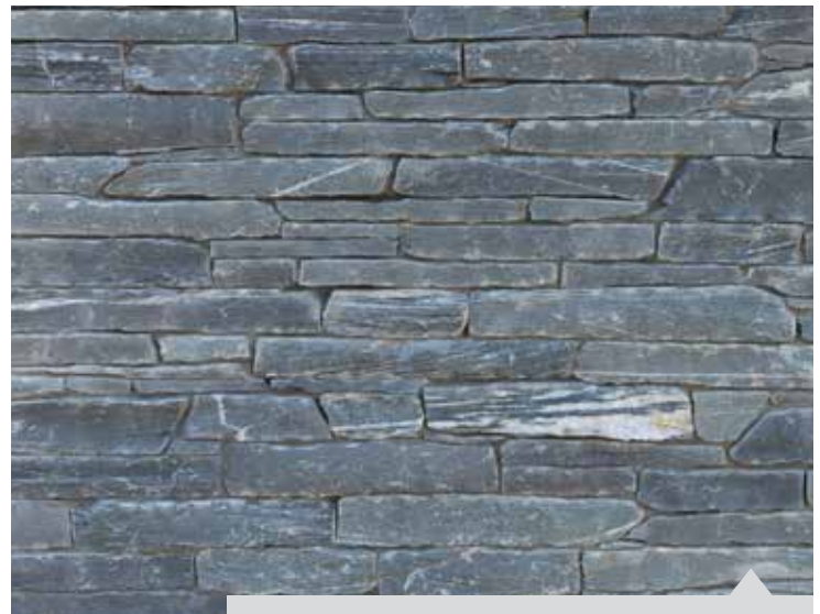
BLACK PEARL MICRO LEDGE