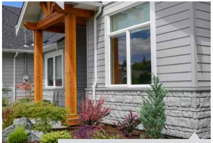
CROWN ISLE GRANITE