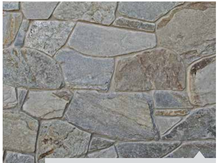
ARBUTUS FIELDSTONE - MORTAR JOINT