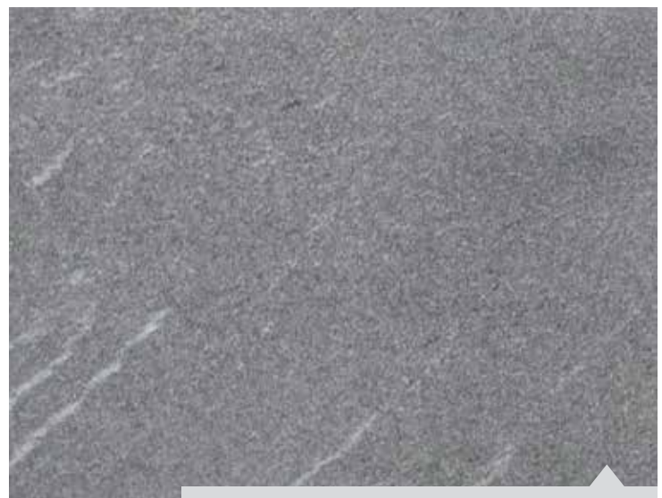
OCEAN PEARL SAWN FINISH