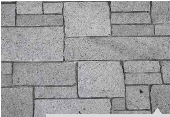
CROWN ISLE GRANITE