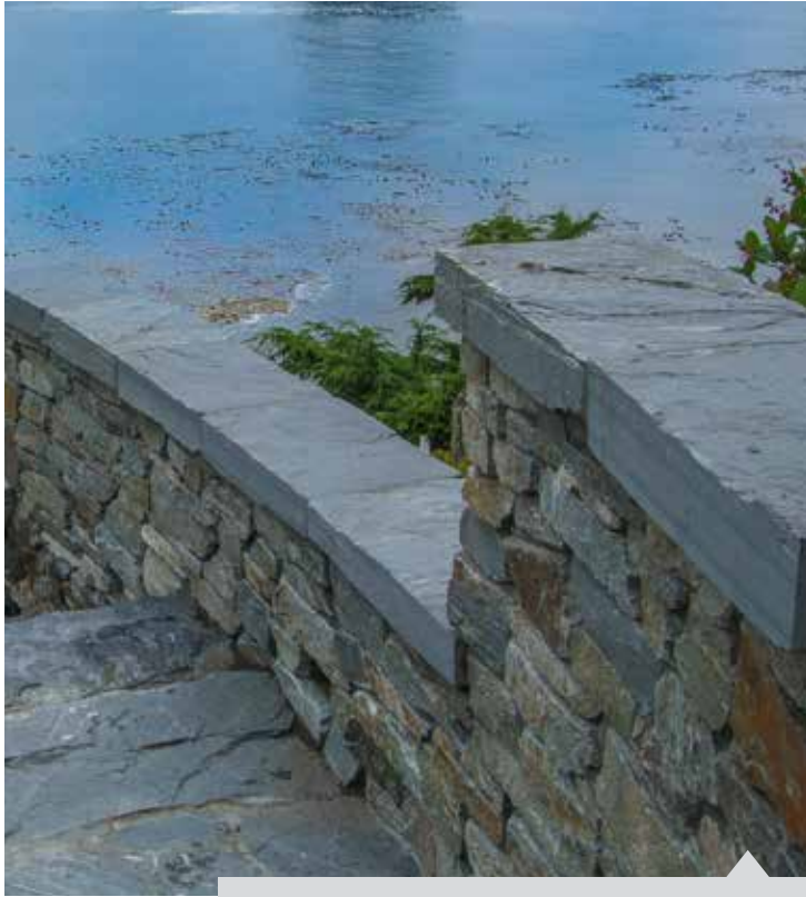
OCEAN PEARL CUSTOM CAPPING