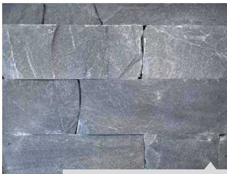
6" PACIFIC ASHLAR