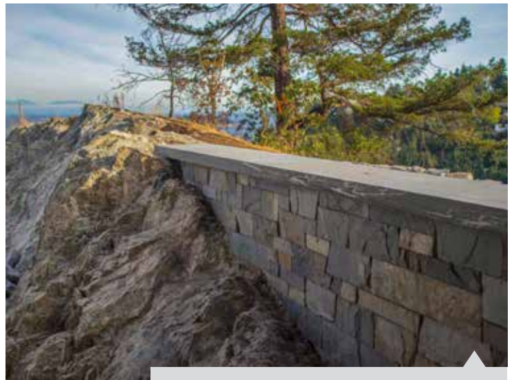
FULL RANGE ASHLAR VENEER