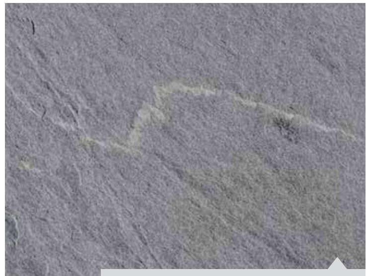
OCEAN PEARL FLAMED FINISH

Available in solid slab pieces with a cut, split, natural, flamed, bush hammered, honed, or polished surface. Custom hearths and mantels can be cut from Ocean Pearl Slate, Newcastle Sandstone or Crown Isle Granite, pieces are a minimum of 2" thick, and up to 9' long. Nothing finishes a fireplace like a solid stone hearth!