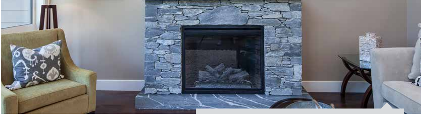
OCEAN PEARL FLAMED FRONT HEARTH AND MANTEL