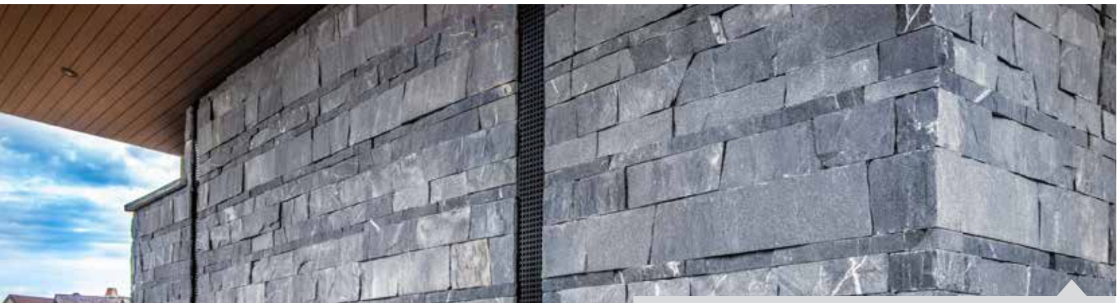
2", 4", 6" AND 8" COURSED PACIFIC ASHLAR