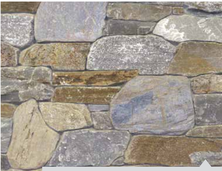
ARBUTUS / NATURAL BLEND - TIGHT FIT