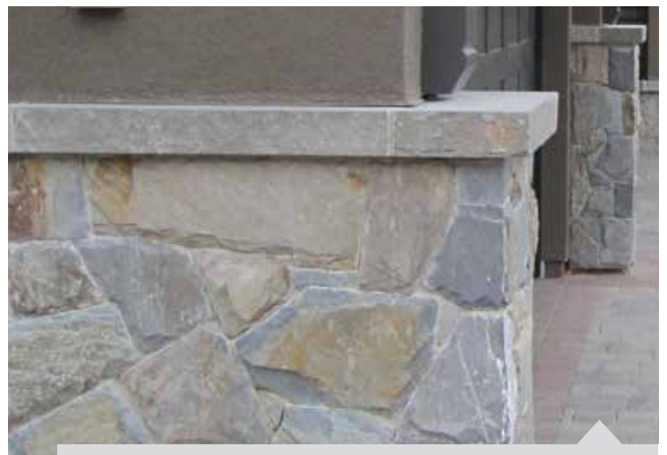
NEWCASTLE WAINSCOT SILL