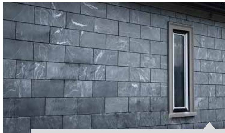
OCEAN PEARL DIMENSIONAL TILE

Available in 12"x12", 12"x24" and custom cut sizes. Our slate tile products can be applied on both interior and exterior wall or flooring surfaces. Typical application types include kitchen flooring, kitchen back splashes, bathroom flooring, bathroom showers, interior feature walls, exterior walls, patio hardscapes, pool surrounds, walkways and interior flooring. Quarried and cut within North America, our new Ocean Pearl slate tiles offer a unique luxury finish hand crafted from our signature Ocean Pearl stone.