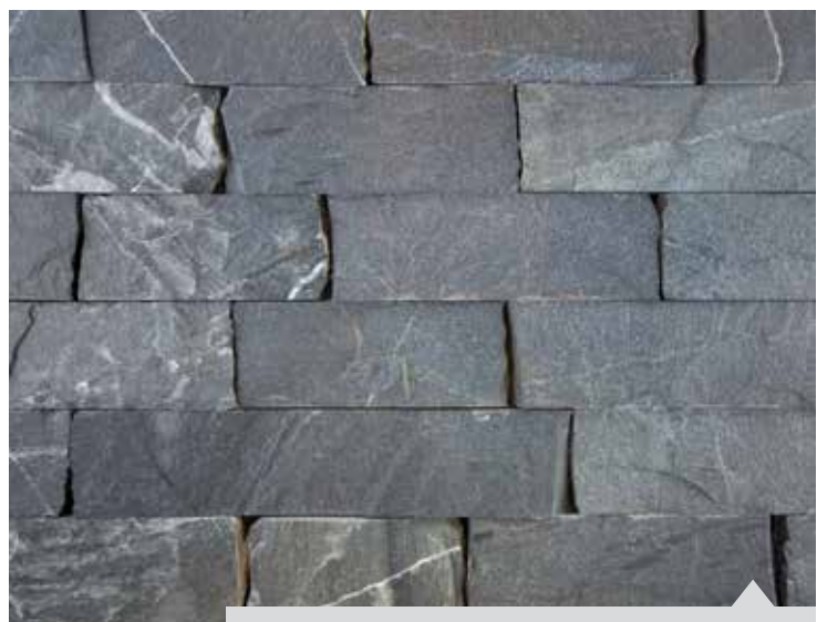
4" PACIFIC ASHLAR