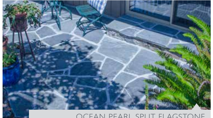
OCEAN PEARL SPLIT FLAGSTONE