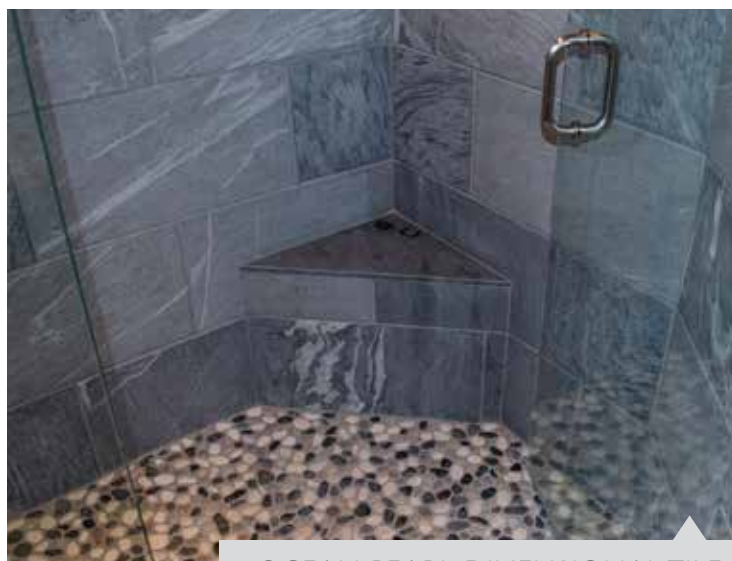
OCEAN PEARL DIMENSIONAL TILE